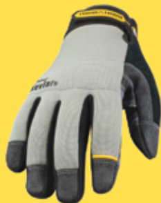
GENERAL UTILITY LINED WITH KEVLAR® mfg# 05-3080-70