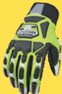
TITAN IMPACT RESISTANT LINED WITH KEVLAR® mfg# 09-9083-10

Offering 12 Styles of Kevlar® Lined Work Gloves