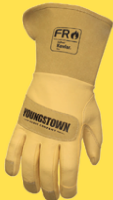
FR LEATHER LINED WITH KEVLAR® WIDE-CUFF mfg# 12-3275-60