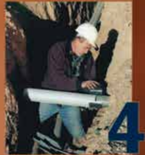
4 Step 4: Attach Adapters