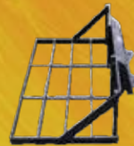
Carry All Leveler