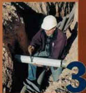
3 Step 3: Snap in Place