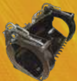
Bucket with Grapples