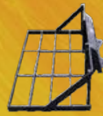
Carry All Leveler