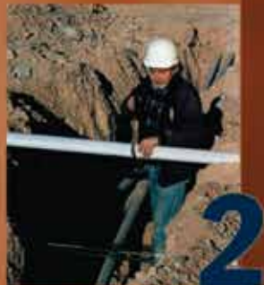
2 Step 2: Cut Split Duct Conduit to Fit