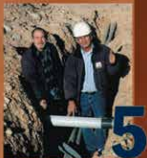
5 Step 5: Finish Job in Record Time

Please Visit Our Website at WWW.CONDUITREPAIR.COM