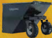
Large Material Bucket